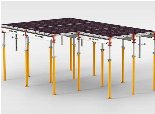
PERI SKYDECK system for concrete floor formwork