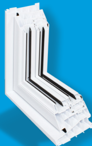
6 in. standard frame