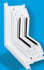
6 5 / 8 in. « with integrated brick molding »